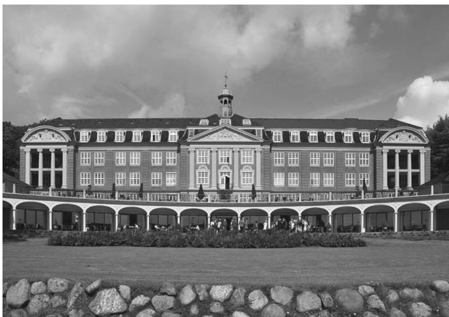
The beautifully preserved Hotel Koldingfjord, where the conference was held.

The purpose of the conference was to exchange ideas and knowledge between countries and to learn how they approached the subject of nursing history. There were eight delegates from Australia. I attended