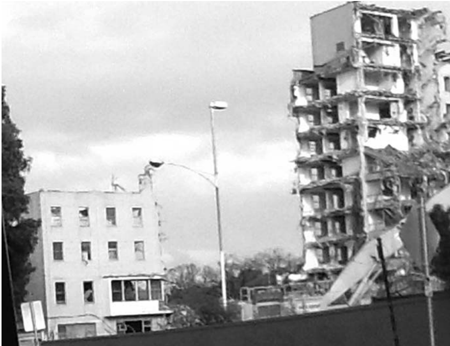
View from Gatehouse Street as the nurses' home is demolished.

The Nurses Home on the corner of Flemington Road and Gatehouse Street has now been demolished as part of the Stage 2 development of the new RCH Project.